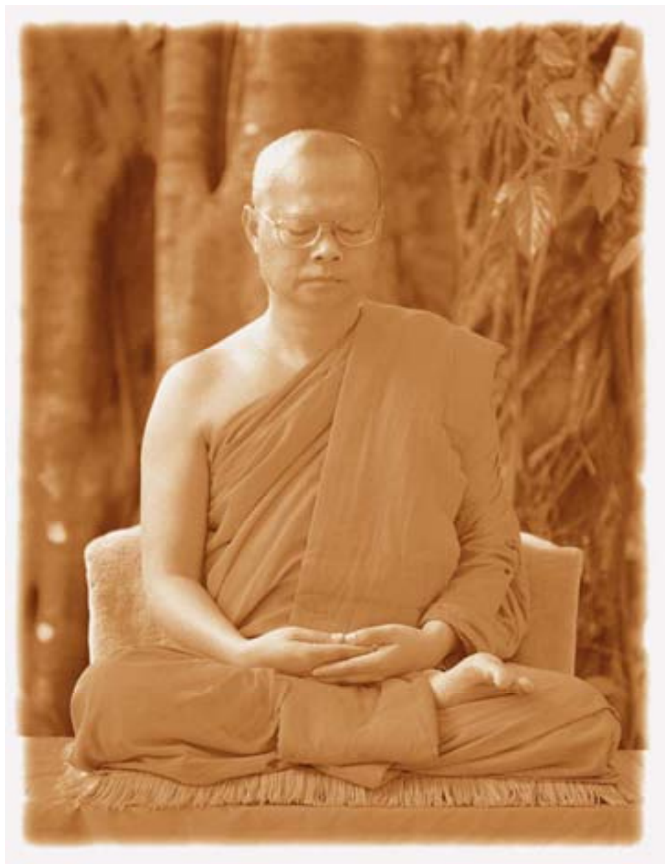
Venerable Ajahn Anan Akiñcano