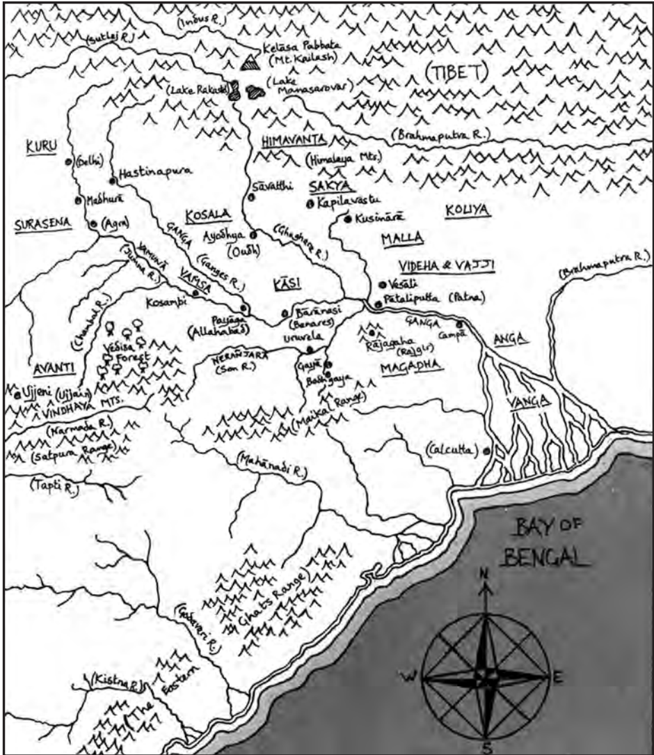
MODERN DAY NAMES IN PARENTHESIS